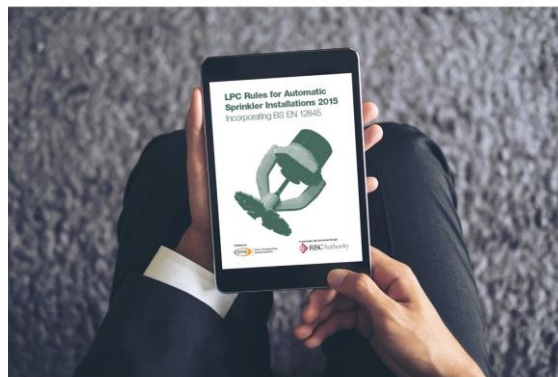
LPC SPRINKLER RULES WITH BSEN12845 AND TBs PDF