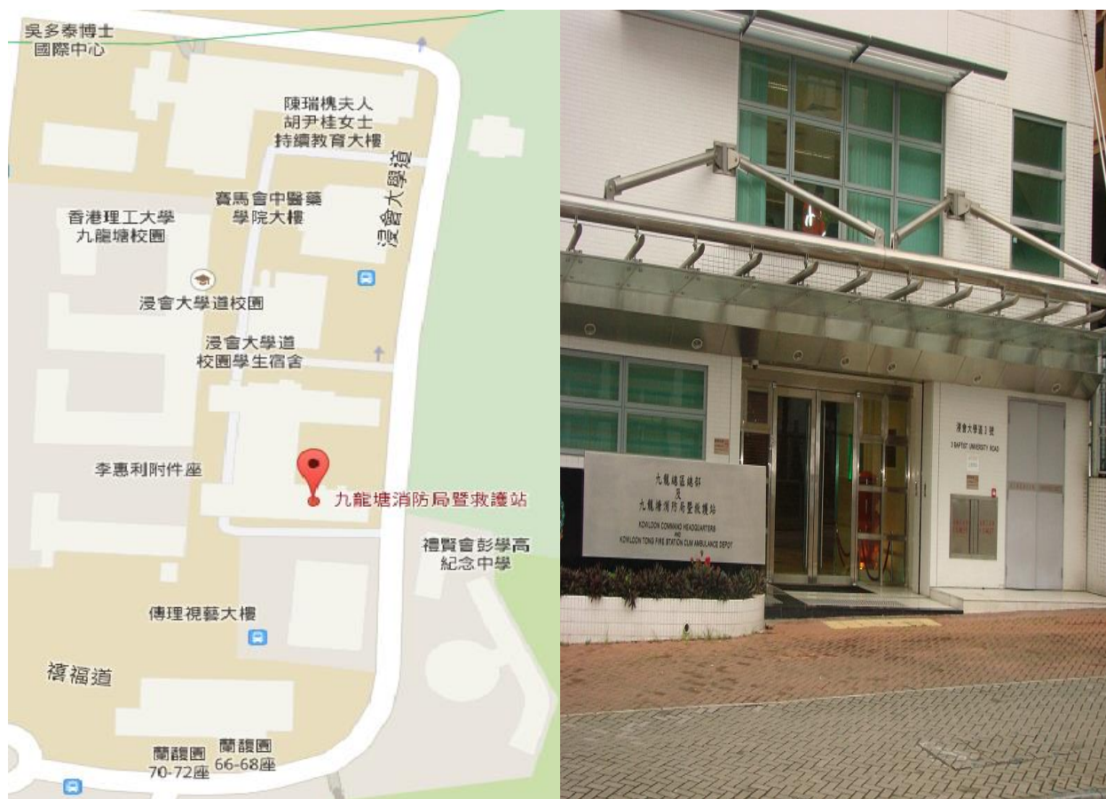
Map of Auditorium, 3/F, Kowloon Tong Fire Station ( 3 Baptist University Road, Kowloon Tong )